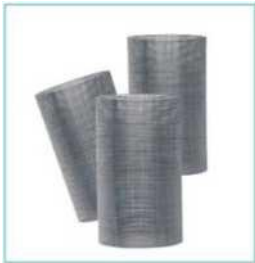
Woven Wire Mesh

Mesh screens, which consist of fine stainless steel wire formed into a mesh arrangement in a plain woven pattern (stainless steel woven wire mesh). Wire mesh can be lined and unlined types. Mesh lined type is a mesh reinforced with a perforated sheet as a backup and is widely used for larger strainers, finer mesh size, higher velocity flow and higher pressure applications. Unsupported wire mesh straining elements are only suitable for small size strainers and low pressure applications.