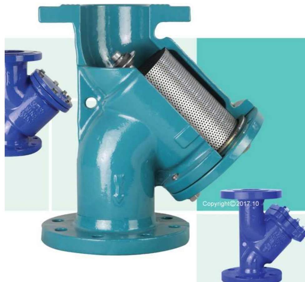
Fig. 6313/6323 ANSI Class150